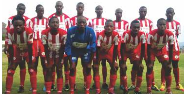
The Senior Team

As it celebrates its 2nd anniversary, the Academy has made its presents felt tremendously in the province by archieving the following: