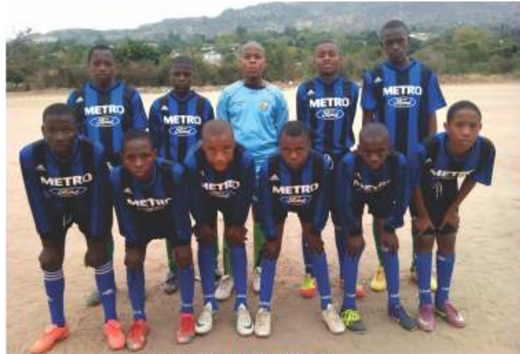
under 15. "acaBarca"