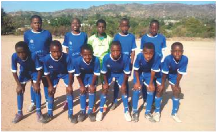
under 12. "the smart boys"