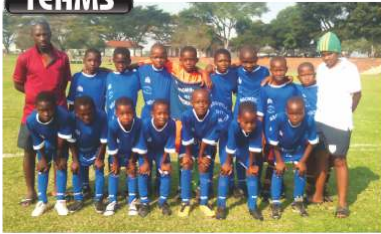
under 10. "takalani"