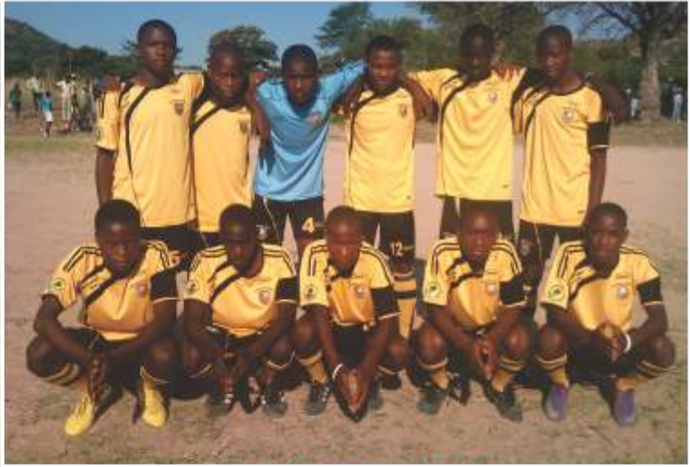
under 17. "the glomour boys"